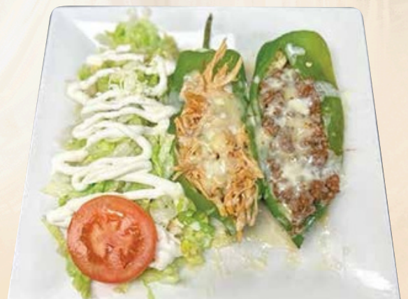
LUNCH SPECIAL #7

SP #1 ONE CHILE RELLENO, ONE TACO, REFRIED BEANS AND GUACAMOLE SALAD 9.75