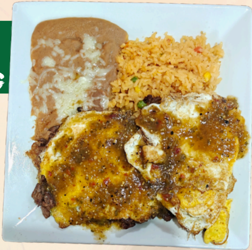
STEAK PICADO WITH EGG